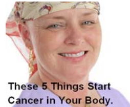
These 5 Things Start Cancer in Your Body.