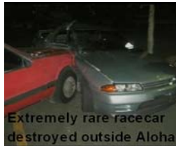
Extremely rare racecar destroyed outside Aloha