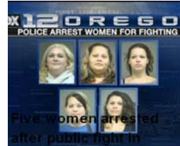
Five women arrested after public fight in