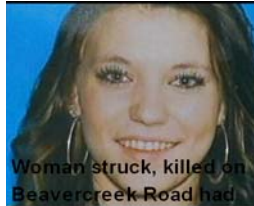
Woman struck, killed on Beaver Creek Road had