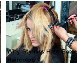
Why Stylists Hate Boxed Haircolor