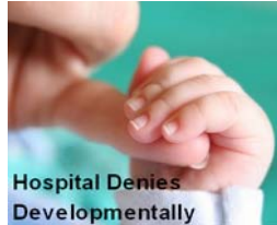
Hospital Denies Developmentally