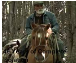
48 Years of Complete Isolation