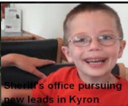
Sheriff's office pursuing new leads in Kyron